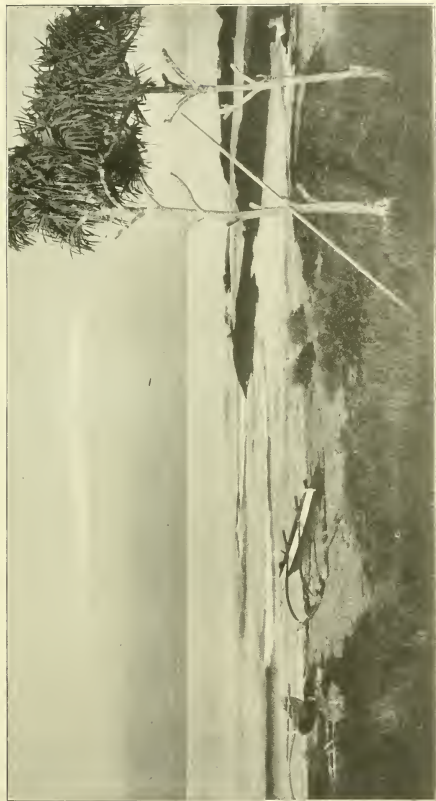
MAUNA KEA IN ITS MANTLE OF SNOW (HENSCHAW)